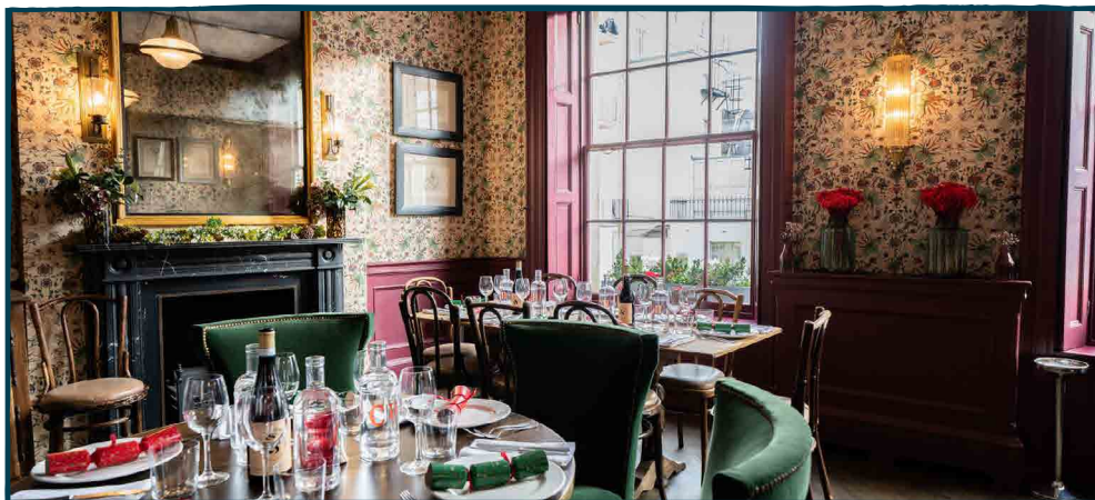
The Front Dining Room