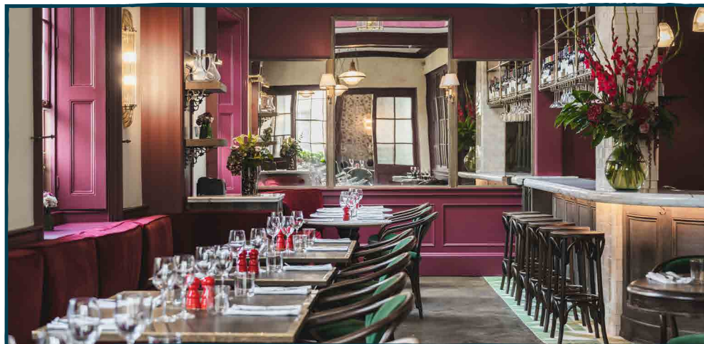
The Back Dining Room