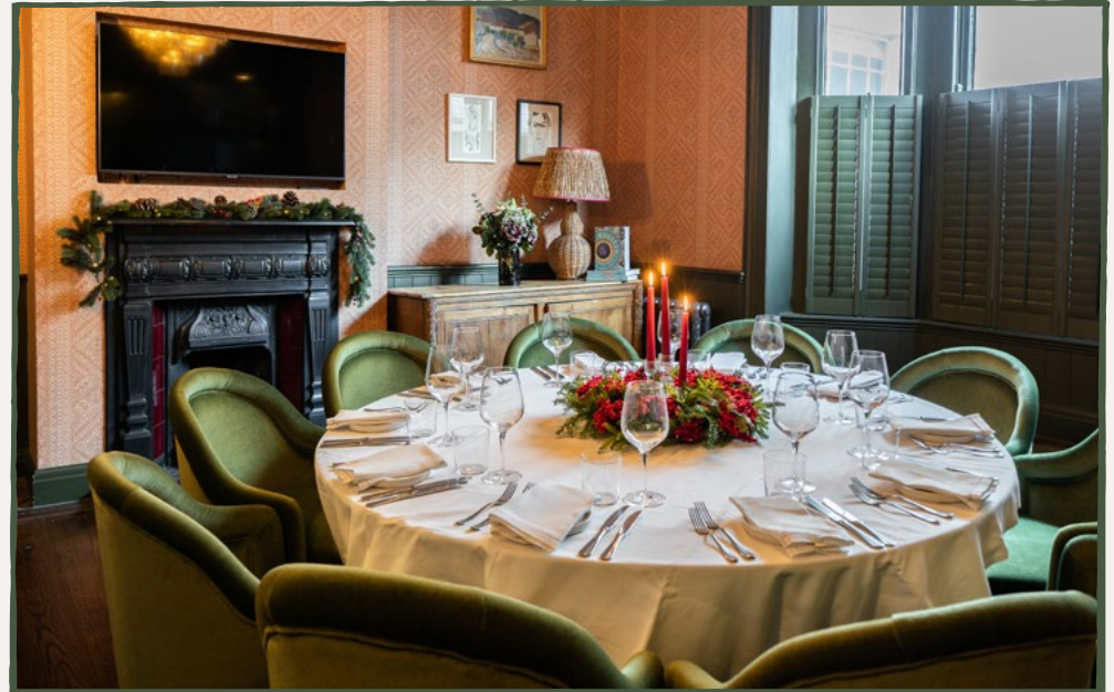
The Charlotte Room