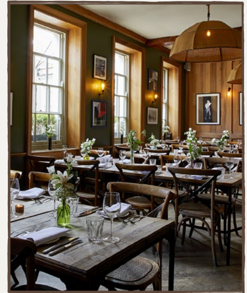
The Front Dining Room