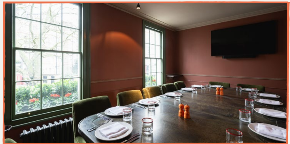
The Feasting Room