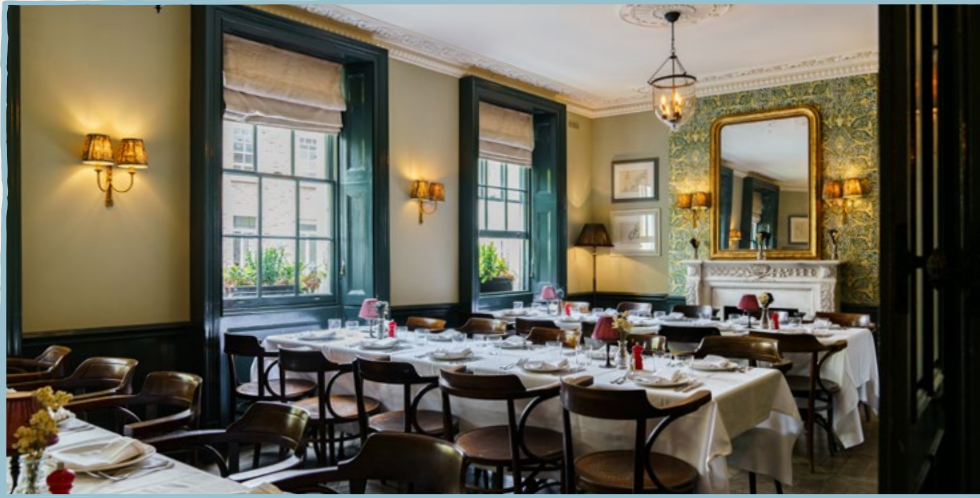
The Main Dining Room The Atrium