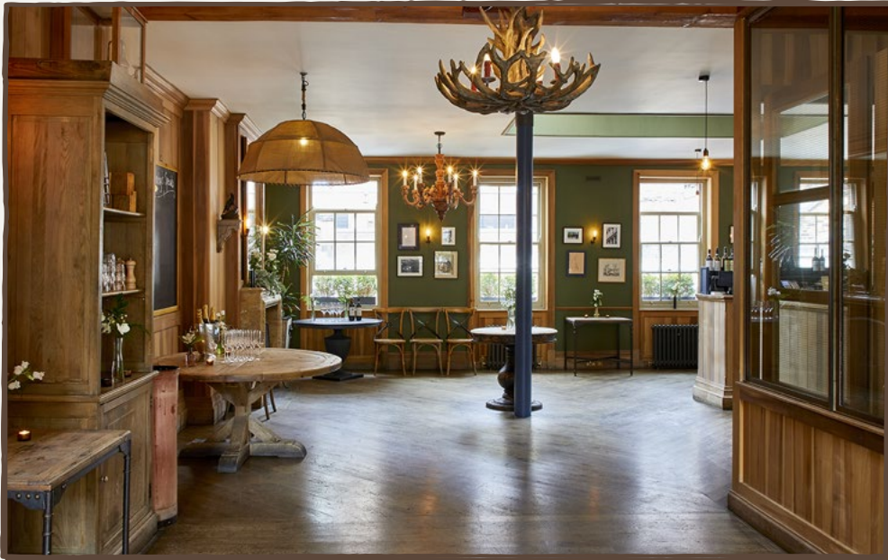
The First Floor Restaurant Exclusive