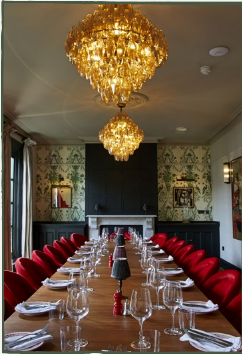
The Victoria Room