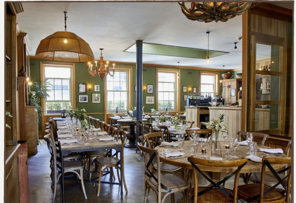
The Back Dining Room