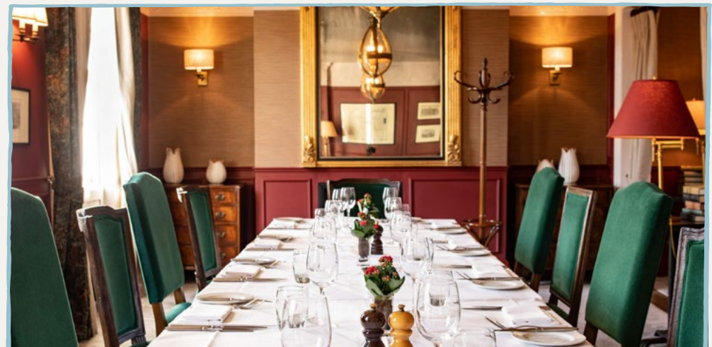
The Small Dining Room The Drawing Room