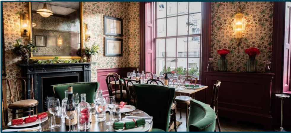
The Front Dining Room